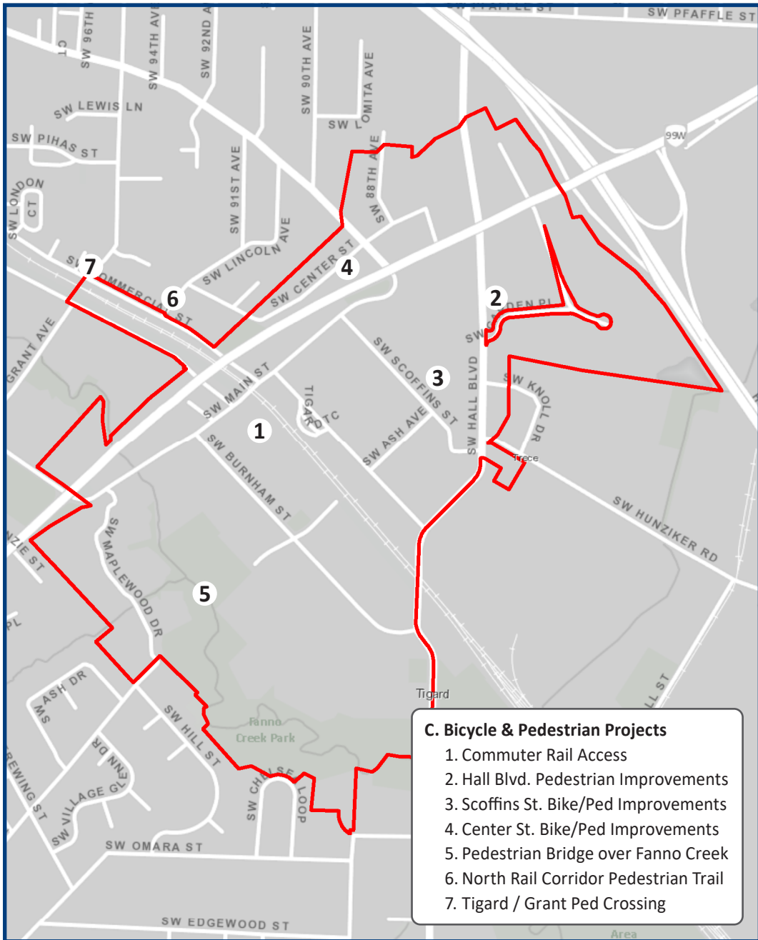
Figure 4: Urban Renewal Bicycle/Pedestrian Projects